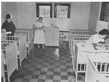
(a) 1960 Nursery Room (Same room as new nursery)

The second room is a handicap accessible bathroom on the lower level. The bathroom replaces a seldom used snack machine room. It includes a fully compliant handicap stool, a changing table and sink. If you have a chance, check out these two new additions to the building.