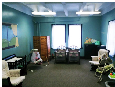
(b) New Nursery Room